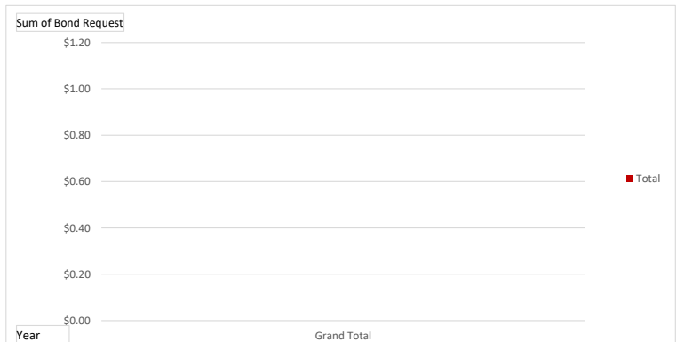
Total Bond Request by Year for House District 40