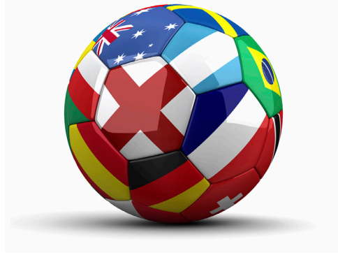
The ever-expanding migration of capital from one country to another has made the world a smaller place to live.

Once we move to a multi-country setting, the issue gets a little more complicated. For our purposes the key exchange is between holders of assets in the tax cut country and holders of assets in countries where taxes are not cut. Once the tax cut has taken place, holders of assets in the tax cut country would require more non-tax cut country assets for every higher yielding asset. Holders of assets in the non-tax cut