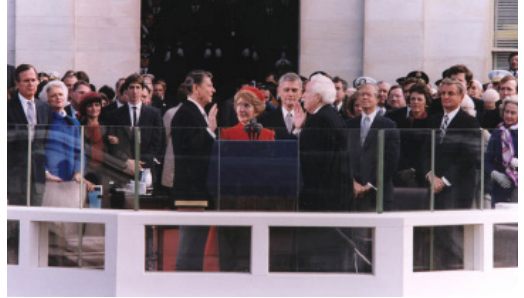
Ronald Reagan's swearing in began an unprecedented period of economic growth.

In 1981, Ronald Reagan became president and all hell broke loose. From 1981 on, the highest marginal federal income tax rate fell from 70% to 28%, the capital gains tax rate went from 50% to 20%, inflation fell from double digits to 2.5%, tariffs were cut dramatically, de-regulation was ubiquitous, government's share