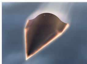
China Conducts Second Test Of Game-Changing Missile