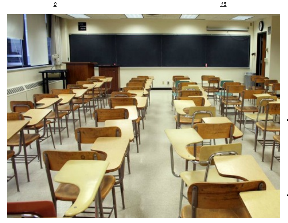
by <u>MICHAEL BARBA (/COLUMNISTS/MICHAEL-BARBA)</u> 9 Jul 2014, 6:01 AM PDT 2 POST A COMMENT (/BREITBART-TEXAS/2014/07/09/OP-ED-PUBLIC-MEANS-OPEN-O-EVERYONE-NOT-JUST-STATE-RUN-SCHOOLS#COMMENTS)

The Texas Constitution places the obligation of educating Texas children upon the state Legislature. Article VII states: "A general diffusion of knowledge being essential to the preservation of the liberties and rights of the people, it shall be the duty of the Legislature of the State to establish and make suitable provision for the support and maintenance of an efficient system of public free schools."