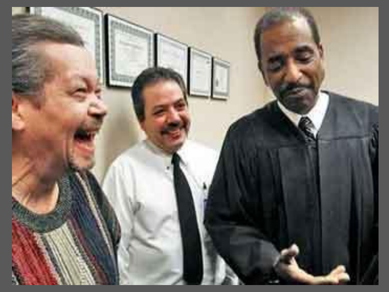
Buffalo, N.Y. Veterans' Court

First in nation Buffalo, N.Y. Veterans Treatment Court launched in 2008. As of Sept. 2009, only 5 of 120 participants removed and none of 18 graduates re-arrested.