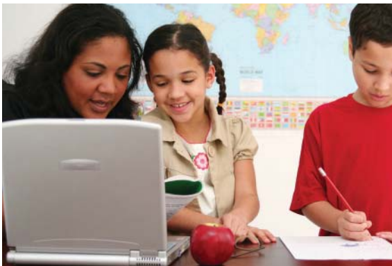
Research clearly shows that the quality of a student's teacher is the most important school-related factor in raising student achievement.

Research clearly shows that the quality of a student's teacher is the most important school-related factor in raising student achievement. In fact, a University of Tennessee study found that a student with a strong teacher for three consecutive years can erase the achievement gap associated with race, ethnicity, and income within three to five years. 19 As large numbers of economically-disadvantaged and minority students continue to fall behind academically and drop out of school, it is vital that policymakers focus on improving teacher quality.