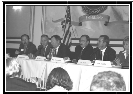
Legislators and experts discuss policy as part of the education panel.