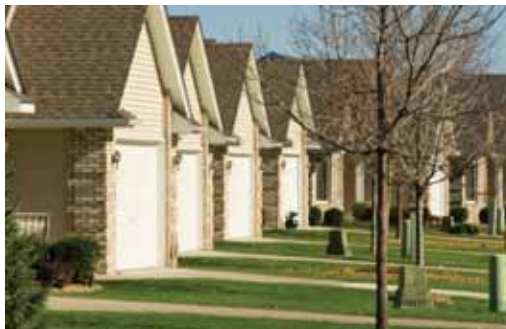
Private property is the foundation upon which all of our other rights are based.

In a system of private property, economic goods are owned by private individuals. Property rights give the owner the ability to use or transfer the item in any way he sees fit, without obtaining anyone else's permission, so long as he doesn't thereby violate someone else's property rights. On the one hand the concept seems obvious, but on the other it was a fairly recent historical development largely confined to the Western European countries. Generally speaking, private individuals in other regions had