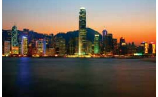
Hong Kong's place as the most economically free country in the world means that it is also one of the wealthiest.

Although it's a pleasant theory that economic freedom goes hand in hand with prosperity, the obvious question arises: Is it actually true? The answer is a resounding "yes"! The Heritage Foundation and The Wall Street Journal , based on significant academic research by economists, put out an annual ranking of countries according to an "Index of Economic Freedom." This index gives countries an overall percentage of economic freedom, based on 10 factors such as trade barriers, tax rates, monetary stability, ability to hire and fire workers, etc.