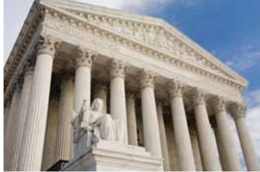
Courts must fairly enforce the law and contracts for the marketplace to operate efficiently.

In a free market, anyone is free to start a business and risk his own (or borrowed) capital, and let the consumers be the ultimate arbiters. This provides the best mechanism to harness the bits of knowledge and expertise that are dispersed throughout the economy. In contrast, under full-blown socialism an innovator would have to send his idea up the chain of command, and wait for approval before carrying it out. Beyond the bureaucracy, this system suffers from the fact that no group of planners—no matter how smart—can possibly amass all the information possessed by the whole of society. Consequently, the decisions of a socialist central board will always be more arbitrary and ignorant, even if the board