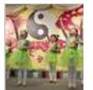
2012 Lunar New Year Celebration, 01.21.12