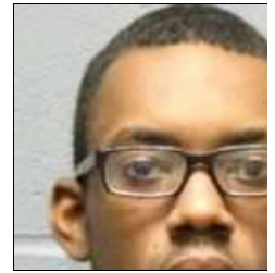
Teens arrested in At Walmart heist