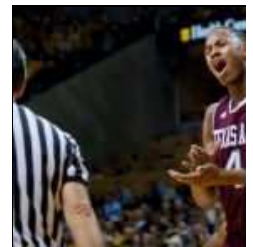
Missouri's 17-0 run c A&M