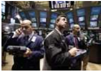
Our curious economic strength