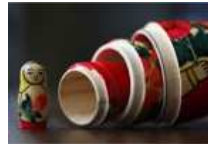
Congressional triggers, ad infinitum