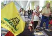
Tea party: Occupy Congress!