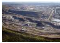
Without carbon price, oil will find a way