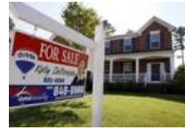
Washington's coming housing crunch