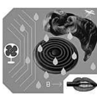
For Some in Menopause, Reconsidering Hormones