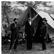
Disunion: The Union's Spy Game