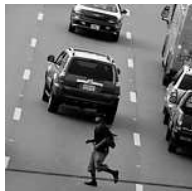
On Wide Florida Roads, Running for Dear Life