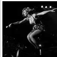
Beyoncé Showcases '4' at Roseland Ballroom