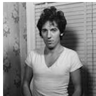
Artists Battle Over Song Rights