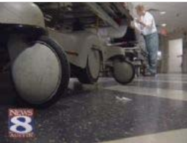
Obama signed the $938-billion health care overhaul Tuesday.