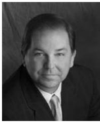
SENATOR KIP AVERITT

Texas faces a daunting challenge to develop additional water supply to meet growing needs. Landmark water legislation (SB 1), enacted in 1997, stipulated that “voluntary redistribution of existing supply” was an optimal means of meeting future demand. In the last 10 years, however, water marketing has been limited to a few areas. What facilitates or discourages water markets? The panel will focus on obstacles, limitations, and opportunities for water markets in Texas.