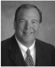
REPRESENTATIVE ROB ORR Texas House of Representatives

An in-depth discussion of provider regulations and the role they play in the health care market. The panel will provide insight on Texas' scope of practice laws and how they affect the price of health care and impact the delivery and accessibility of services.