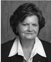
REPRESENTATIVE LINDA HARPER BROWN

Our state's transportation infrastructure is under tremendous strain due to unbridled economic and population growth. Policymakers seeking to fund solutions to these challenges face many obstacles, from skyrocketing inflation on construction materials to reduced tax revenue due to increasing vehicle fuel efficiencies. This panel will examine options that leverage private-sector efficiencies to stretch taxpayers' limited fuel tax dollars.