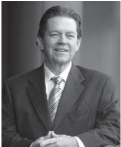
ARTHUR B. LAFFER, PH.D.