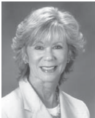
SENATOR FLORENCE SHAPIRO

Charter schools are subject to less regulation and therefore have freedom to innovate. What best practices can we learn from charter schools? How are charter schools performing in comparison to traditional public schools? This panel will address public charter schools from a variety of perspectives.