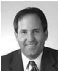
REPRESENTATIVE KEN PAXTON Texas House of Representatives