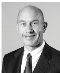
SENATOR JOHN WHITMIRE

While Texas criminal justice reforms made since 2005 have attracted national attention, the state still has the nation's second highest incarceration rate and the prison system is seeking another $1.08 billion just to run existing facilities. Meanwhile, the Texas Youth Commission is smaller and more accountable, but the jury is still out on the effectiveness of its programs. With these and many other challenges, Texas policymakers will once again consider reforms to ensure taxpayers' money is spent wisely to protect public safety, restore victims, and reform offenders.