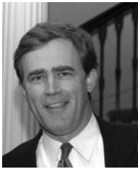
REPRESENTATIVE DAN BRANCH Texas House of Representatives

The first payment on the new margins tax has been made. According to the Comptroller, revenue from the initial collections was slightly lower than expected. With the economy cooling, what effect will the state's new tax on businesses have on job creation, investment, and wages? Is this tax really more equitable than the previous franchise tax or does it, as many claim, punish small- and medium-size businesses and unfairly benefit larger, more capital intensive businesses? A knowledgeable panel with diverse views explores the viability of this tax and possibly determines the fate, short- and long-term, of the revised business tax.